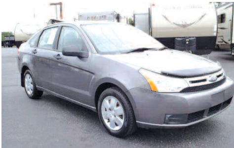
2008 FORD FOCUS