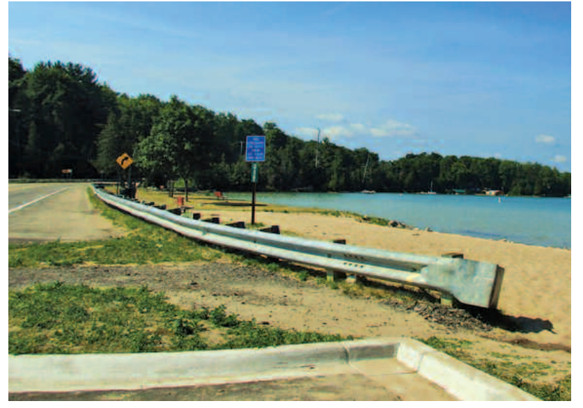
Local officials want to keep the current metal guardrail at Walloon Lake Beach because they say it has for 25 years proven a safe and effective barrier between motorists and beach-goers.