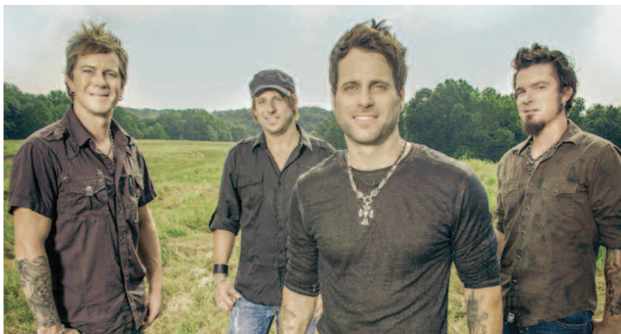
Country music fans enjoy the performance of Parmalee (shown here) & Love and Theft next Saturday evening, August 27, in the Grandstand area.

EAST JORDAN CITY COMMISSION MEETING, AUGUST 18, 2016