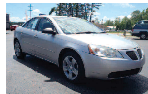
2008 PONTIAC G6 SEDAN