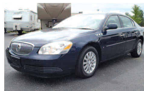
2008 BUICK LUCERNE