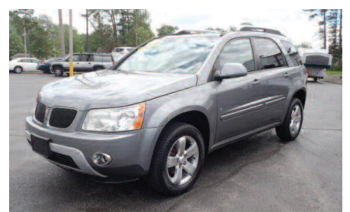
2006 PONTIAC TORRENT