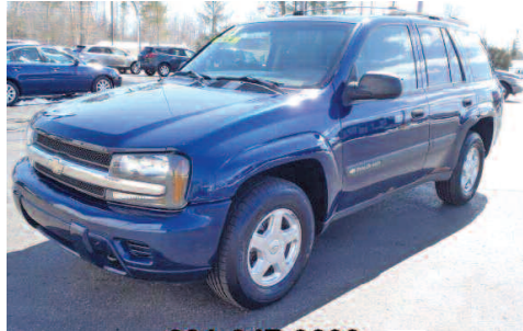
2003 CHEVY TRAILBLAZER