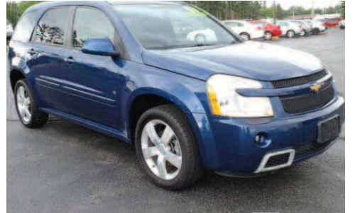
2008 CHEVROLET EQUINOX LTZ