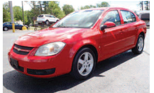
2008 CHEVROLET COBALT LT1