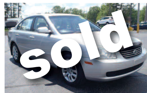
2008 KIA OPTIMA LX