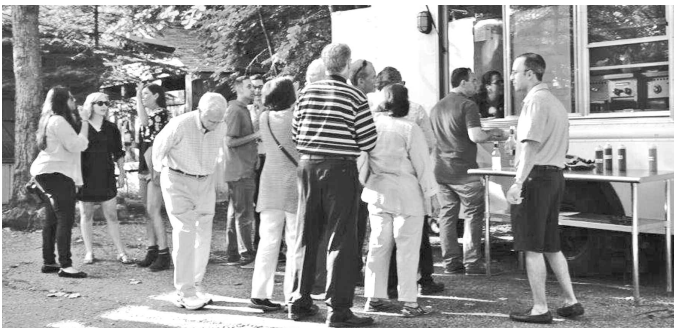
Charlevoix County's Hayes Township Board and the Parks and Recreation Advisory Committee will hold its Annual Picnic at Hayes Township Park Camp Sea-Gull on Sunday August 21 from 1 to 4pm.

Charlevoix County's Hayes Township Board and the Parks and Recreation Advisory Committee will hold its Annual Picnic at Hayes Township Park Camp Sea-Gull on Sunday August 21 from 1 to 4pm. Hayes Township Park Camp Sea-Gull is located at 08580 Boyne City Road, Charlevoix.