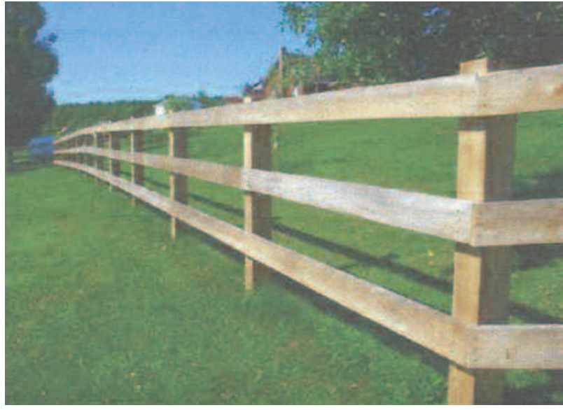
Area residents along with officials in Melrose Township and Charlevoix County fear this split-rail fence that MDOT has proposed to replace the current metal beach guardrail along M-75 at Walloon Lake Beach won't be as safe as the current metal railing.

Bodell also cited concerns about the how the current guardrail is "posted and bolts exposed at child's head height", denoting a child could possibly be injured by running into