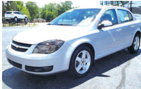
2008 CHEVY COBALT