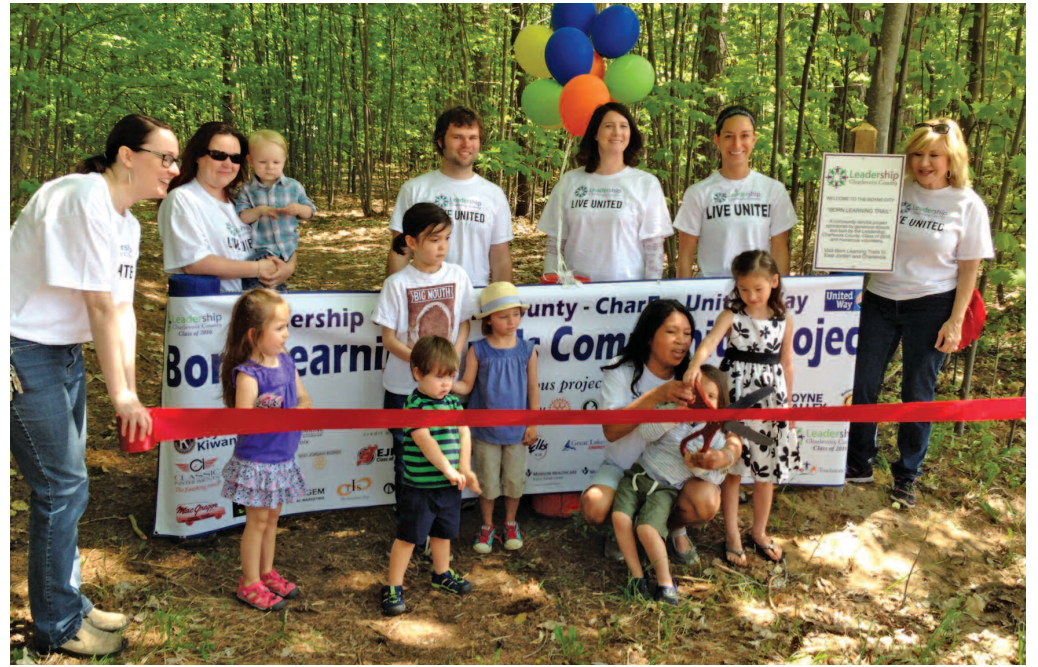
Leadership Charlevoix County Class of 2016' Community Service Projects were Born Learning Trails in Beaver Island, Boyne City, Charlevoix and East Jordan.

Projects from past classes have included: 2012 – Community Free Clinic promotion and renovations, Boyne City 2013 – Mobi-Mats fundraising and installation