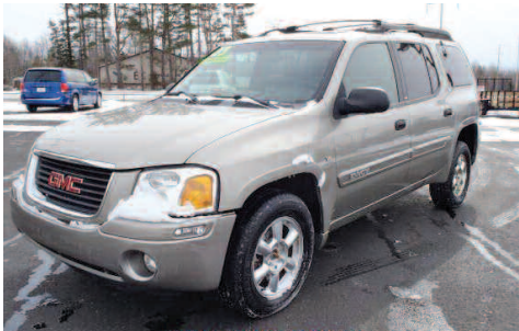
2003 GMC ENVOY 4WD