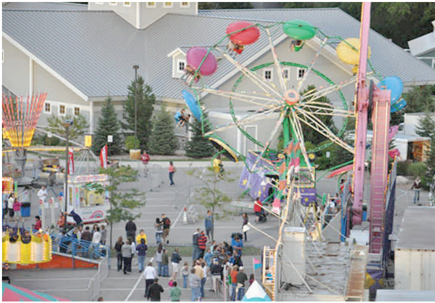
The Emmet-Charlevoix County Fair is set to open once again this Tuesday, August 23 and continue through the Sunday, August 28.

Country music fans enjoy the performance of Parmalee & Love and Theft next Saturday evening, August 27, in the Grandstand area. 2016 Academy of Country Music New Vocal Duo/Group of the Year nominee, Parmalee, had three Top 10 songs from their debut album, "Feels Like Carolina," including the title track, "Close Your Eyes," and "Already Callin' You Mine." Love and Theft have scored a number one country hit, "Angel Eyes," and Top 10 hit "Runaway."