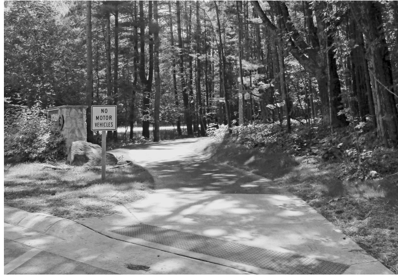
The growing number of non-motorized trails like this one recently completed through Young State Park near Boyne City has local officials looking into legislation that would require cyclists who use them to pay a licensing fee in order to offset the cost of trail maintenance.