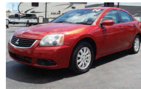
2009 MITSUBISHI GALLANT