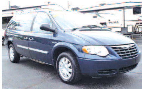
2007 CHRYSLER TOWN & COUNTRY