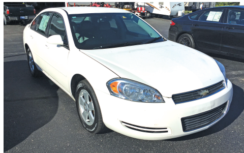
2008 CHEVROLET IMPALA