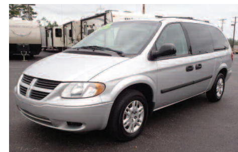
2006 DODGE GRAND CARAVAN SE