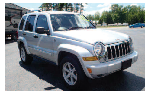
2006 JEEP LIBERTY LIMITED 4WD