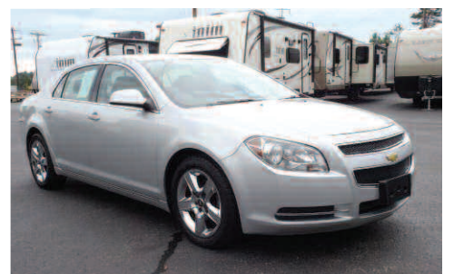
2010 CHEVROLET MALIBU 1LT